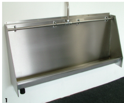
1 WHUE Exposed Sparge wall hung urinal

Wall hung urinals are supplied as standard with combination ends suitable for exposed or side wall applications, a plastic automatic flushing cistern, stainless steel 22mm downpipe, 38mm (1½" BSP) waste fitting, downpipe clip & stainless steel fixing screws