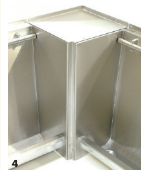
1 FRUJCT Joint cover trim for floor recessed urinal