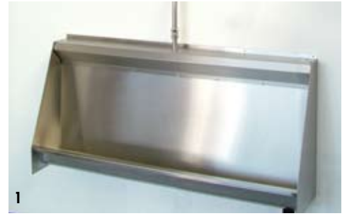
1 WHUC Concealed Sparge Wall Hung Urinal (Accessories see p3)