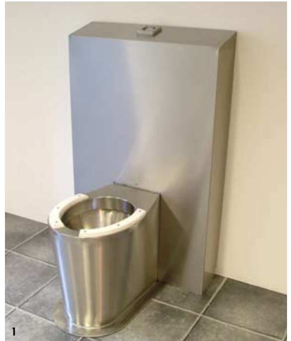
1 Barnfield WC Suite